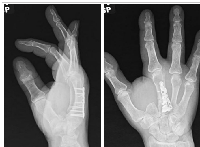
Figure 4: Four-month follow-up X-rays.