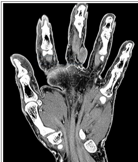
Figure 2: Coronal cut of computed tomography scan demonstrating mass in the long finger.

There is debate about the recommended treatment for synovial sarcoma of the hand with no standard of care. While authors agree on excision, the use of radiation differs. It is shown to decrease local recurrence but does not affect overall survival [4, 10]. There was a significant decrease in local recurrence risk with radiation in those with marginal resection, but no difference in patients with a wide resections [1, 5]. There is no evidence that chemotherapy improves progression-free survival or overall survival, but may be used for those with metastases [1, 4, 10].