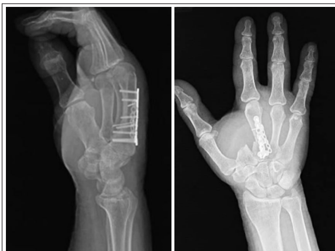
Figure 3: Initial 2-week follow-up X-rays.

There have been limited case reports in the past 15 years on synovial sarcomas of the hand. Outani et al. performed a retrospective review on 137 patients diagnosed with synovial sarcoma at their institution, of which included five cases that involved the hand. Two underwent marginal excision with chemotherapy and radiation, one had a wide excision without chemotherapy or radiation, one had a double ray amputation with chemotherapy and radiation, and one refused surgery. Those who had surgery were disease-free on follow-up. The patient that refused surgery had distant metastases and died [6]. Michal et al. performed a retrospective review on 13 patients with “minute” synovial sarcoma of the hand measuring <1 cm in greatest diameter. They found that patients with complete follow-up did not develop metastases, but four patients out of the full 21 (included feet and hands) had local