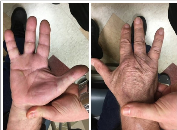
Figure 5: Healed incisions at 4 months.

recurrences. This shows the importance of regular follow-up and that the small synovial sarcomas have a low likelihood of metastases [3].