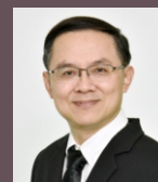
Dr. Winai Sirichativapee

© 2017 by Journal of Bone and Soft Tissue Tumors | Available on www.jbstjournal.com | doi:10.13107/jbst.2454-5473.146